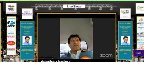
Shri Kailash Choudhary