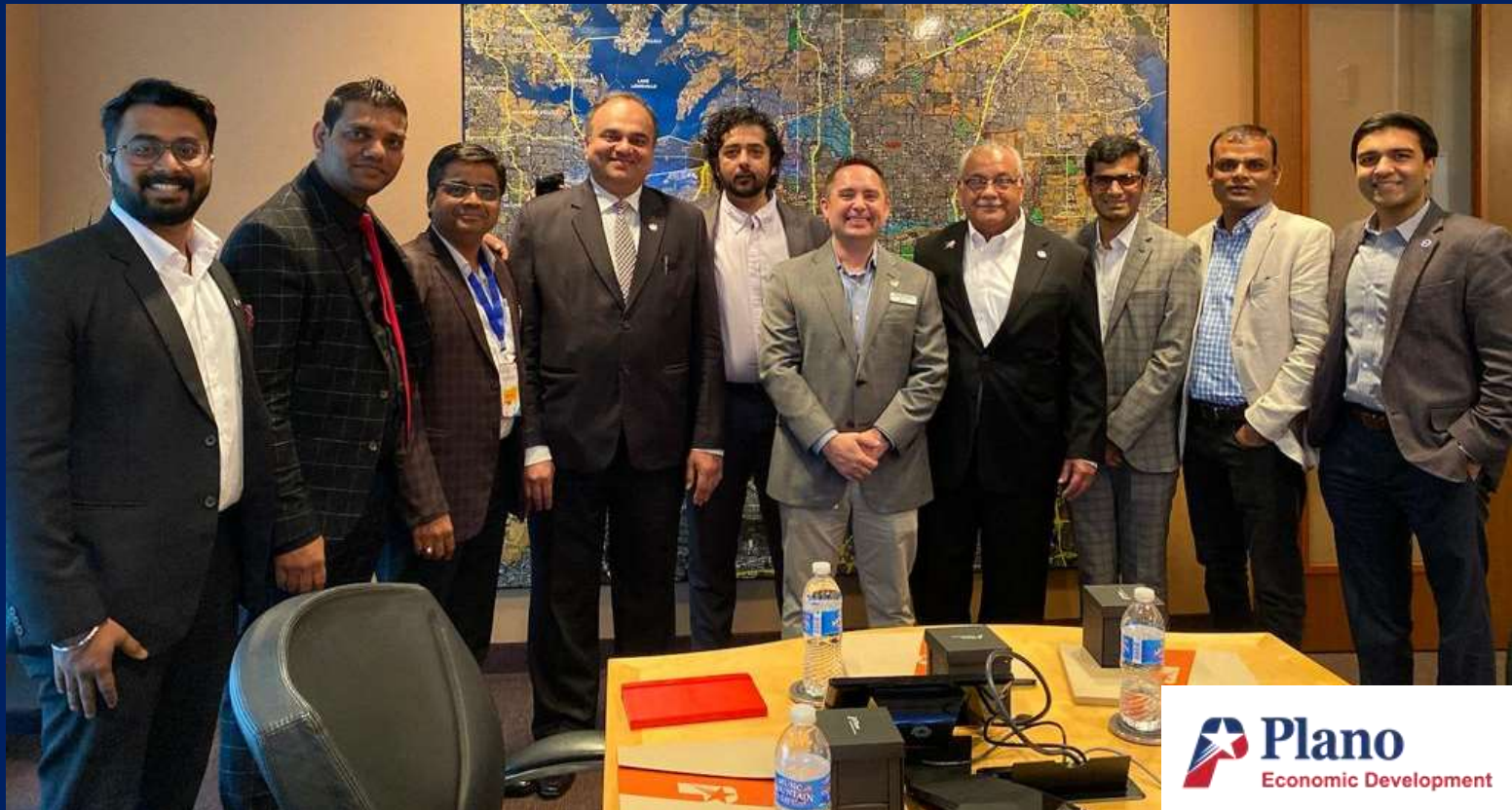
Meeting with PLANO EDC in Dallas