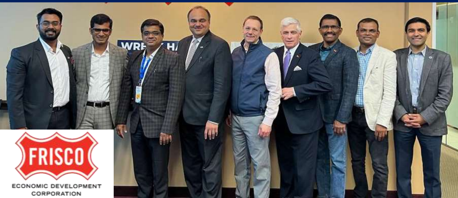
Economic Development Centres of FRISCO EDC in Dallas