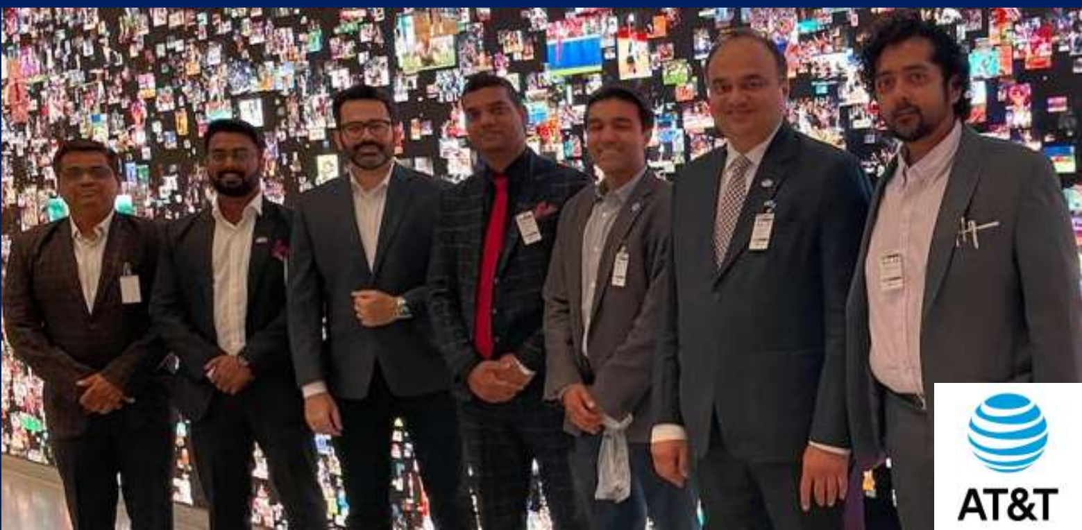
AT&T Headquarter Visit