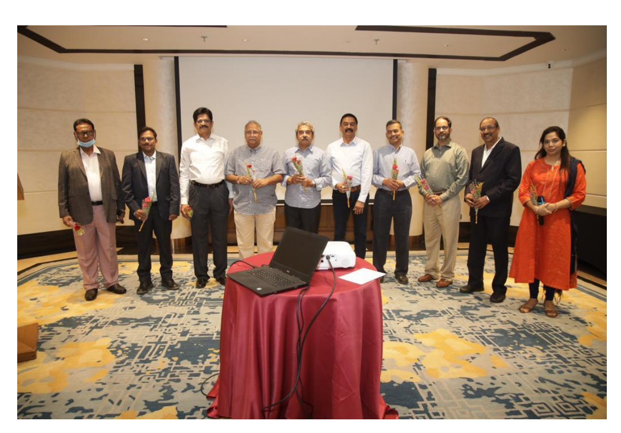
IACC AP & TS Leadership in Visakhapatnam