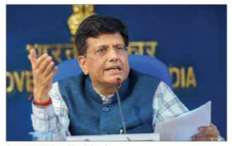
Commerce Minister Piyush Goyal

India is now moving beyond a "low-cost service provider" to a "high value added partner" and the back offices in India are evolving into brain offices,