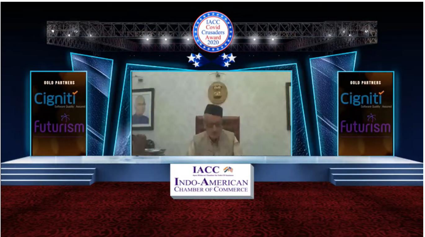
Chief Guest, Hon'ble Governor of Maharashtra, Shri. Bhagat Singh Koshyari delivering the Keynote Address