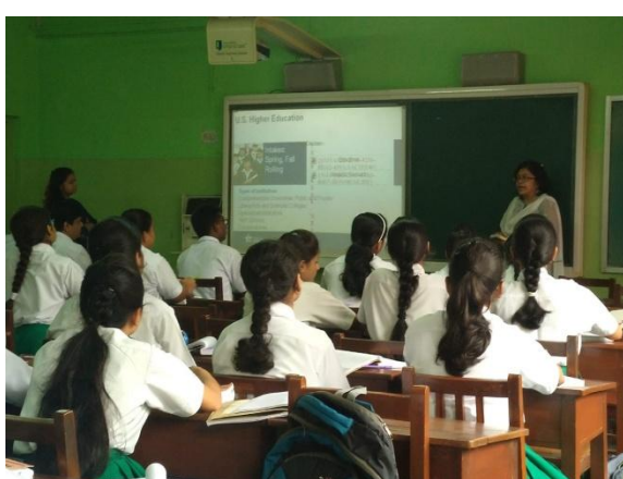
Little Flower School