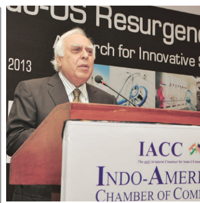
Mr. Kapil Sibal, Hon'ble Minister for Communications & Information Technology and Law & Justice, GOI addressing the Summit