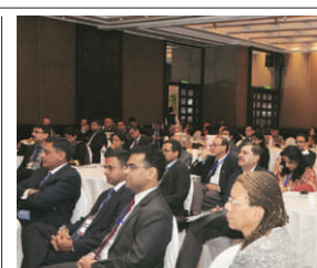
Participants at the Summit