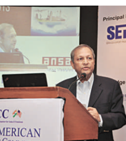
Mr. Ronen Sen, Former Indian Ambassador to US addressing the session