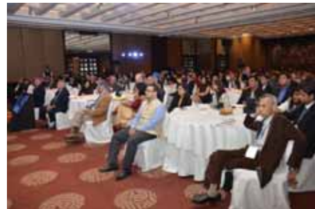
Participants at the Summit

line-up of speakers and provided excellent opportunity to soak in thought provoking discussions and industry insights. It also presented a great window to interact with these luminaries and also amongst the distinguished participants with a total footfall of over 250 delegates on both the days.