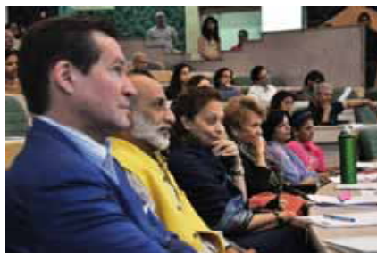
Participants during the event