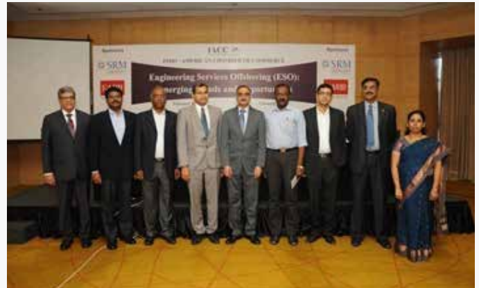
Panel members posing for a photo session with IACC office bearers.